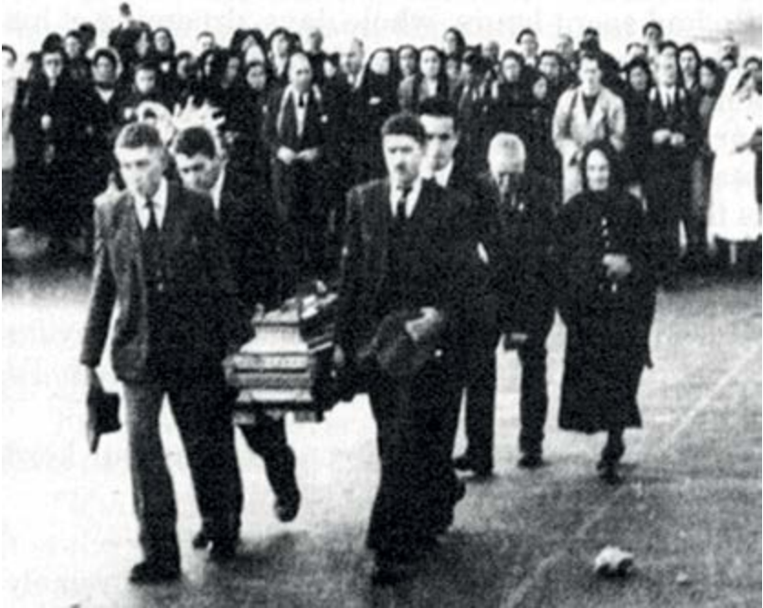
The funeral of Jacinta Marto

Church, the sufferings and calamities which he would have to undergo must have something to do with the ruin and destruction of the Church. In fact, the whole ambition of the devil is twofold: the damnation of men, and the destruction of his great adversary, which threatens his tyranny on earth – the Kingdom of God, the Holy Catholic Church. And because the Church is hierarchical, the central attack against the Church will be directed against the Pope.